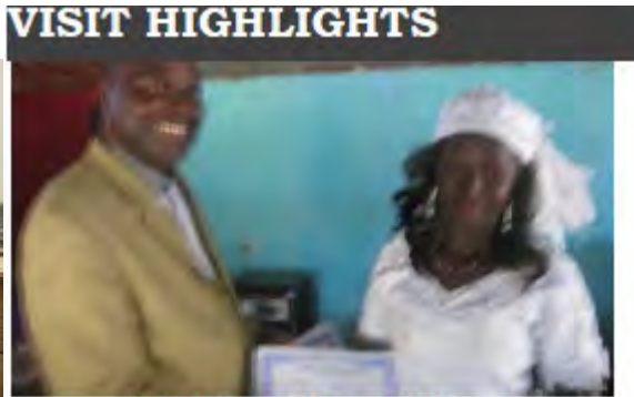
Giving CHM certificate