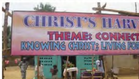
Conference in Sierra Leone

With about 60% of the population Muslim and remaining 40% being Christians and traditionalists, she squares squarely in the 10/40 window for gospel impact. The ministry of the church is to do the work on a new church plant in Liberia. The leaders from this church plant also were in attendance at this leadership forum. (see p.3)