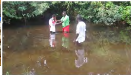
Baptism in Sierra Leone

feet that would run to their aid Jesus. As specific localities and are identified, leaders are trained and sent to plough through the field with the aim of winning souls for Christ. Also, essential projects that will advance the lives of the people, such as schools, job skills and life support provisions are embarked on for the benefit of the people. It is the outcome of these activities that mission harvest news seeks to share with you and also invite you to join through your prayers and other ways in being the hands and feet, the eyes and ears of the Lord to the people we all are sent to reach.