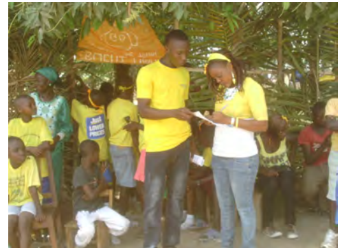
Sports officials conferring

Matthew 5:1-2 ; And seeing the multitudes, he went up into a mountain: and when he was set, his disciples came unto him: [2] And he opened his mouth, and taught them, saying,