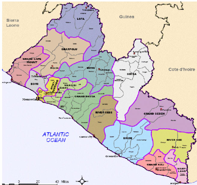
Map Of Liberia

The need to extend the gospel to the people of this west African state is similar to those stated for the peoples of Sierra Leone. The population standing at about 3.5 million people half of which are youths under the age of 18 is rife and much ready and eager for more outreach efforts. This is important when we take into account that 40% of the popula-