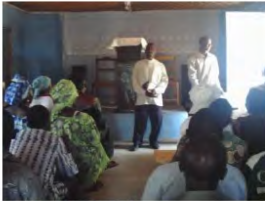
Inside the church

forward to many, otherwise disad- ing to know the lord, turning their having the hope of heaven that is that believe . The response we have the years are encouraging but can is growing need emerging as we