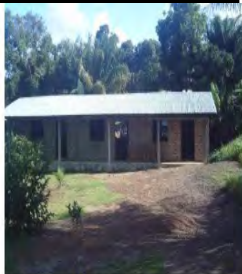
School in Liberia

YOU'VE GOT SOMETHING TO SAY ..... SHARE IT IN AFRICA.