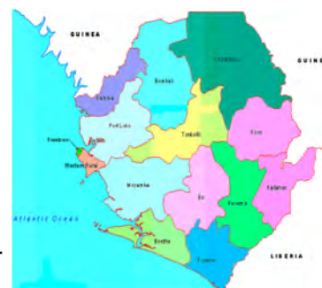
Map of Sierra Leone

With about 60% of the population Muslim and remaining 40% being Christians and traditionalists, she squares squarely in the 10/40 window for gospel impact. The ministry of the church is to do the work on a new church plant in Liberia. The leaders from this church plant also were in attendance at this leadership forum. (see p.3)