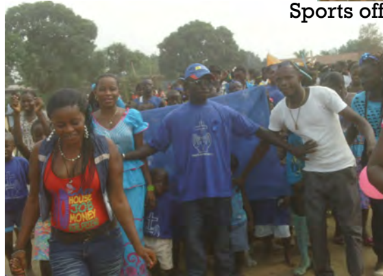
Athletics meet, Leading a sports team