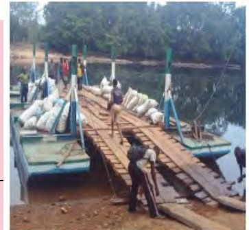
Journey to Liberia across the Atlantic Ocean

The advanced training session highlighted tools and (see p.2)