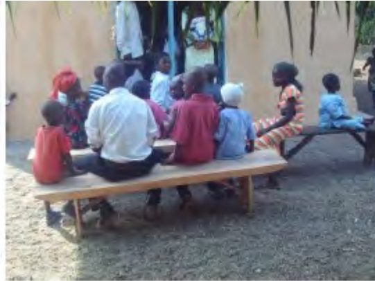
The church in Bawumalugabu Bo

vantaged; com- lives around and promised to all garnered over be better. There move forward. We are neces- sarily regularly positioning and repositioning to be able to give the best we've got and our ut- most to meet the emerging needs.