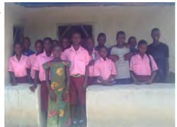
Secondary school in Bo City