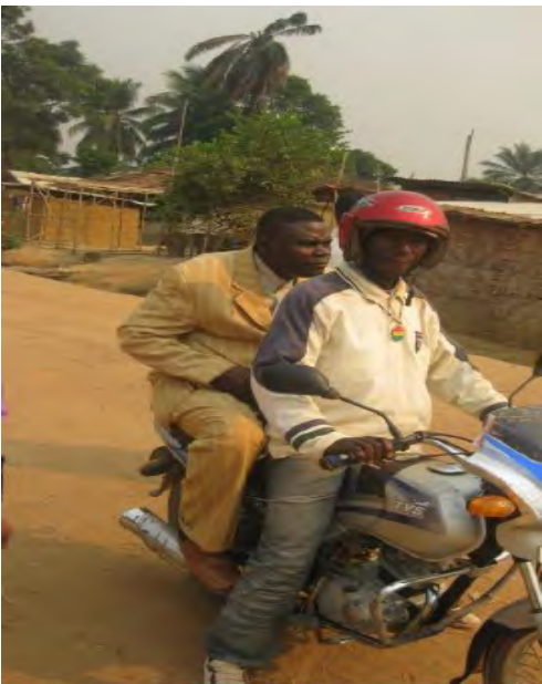
Transport in Sierra Leone

The region designated as the 10/40 window of the world, which represents the least reached people of the world in terms of gospel message accessibility and reception; and also regarding standard of living, as a focus of service is begging for hands and in the name of Jesus people groups